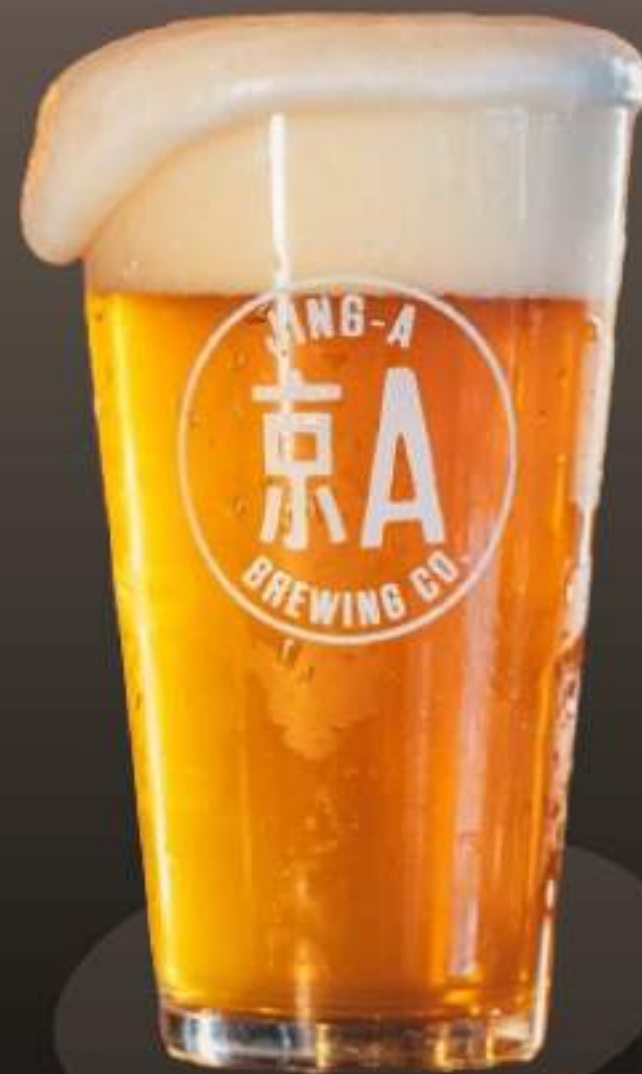
JING-A PALE ALE

*PRICES NOT INCLUSIVE OF 10% SERVICE CHARGE AND ANY APPLICABLE GOVERNMENT TAX