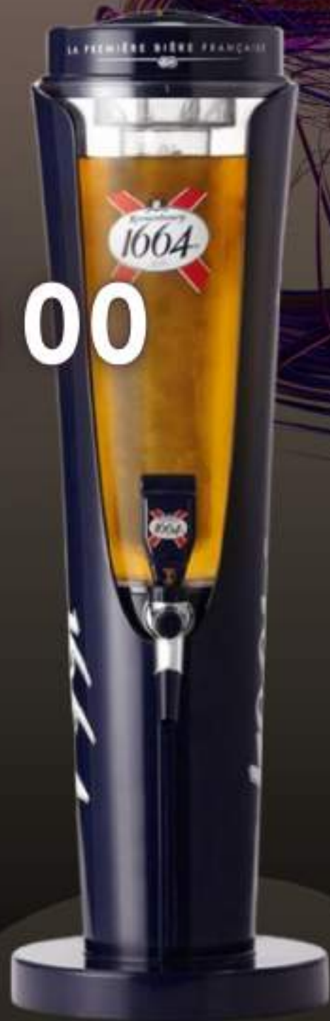
3L K BLANC TOWER