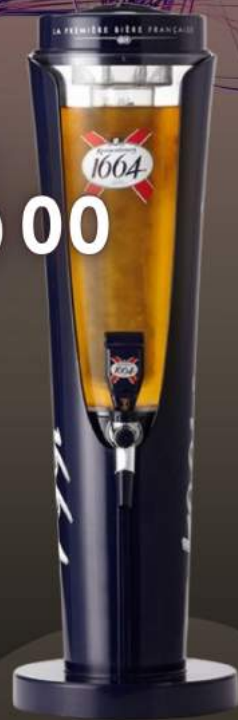
3L K BLANC TOWER